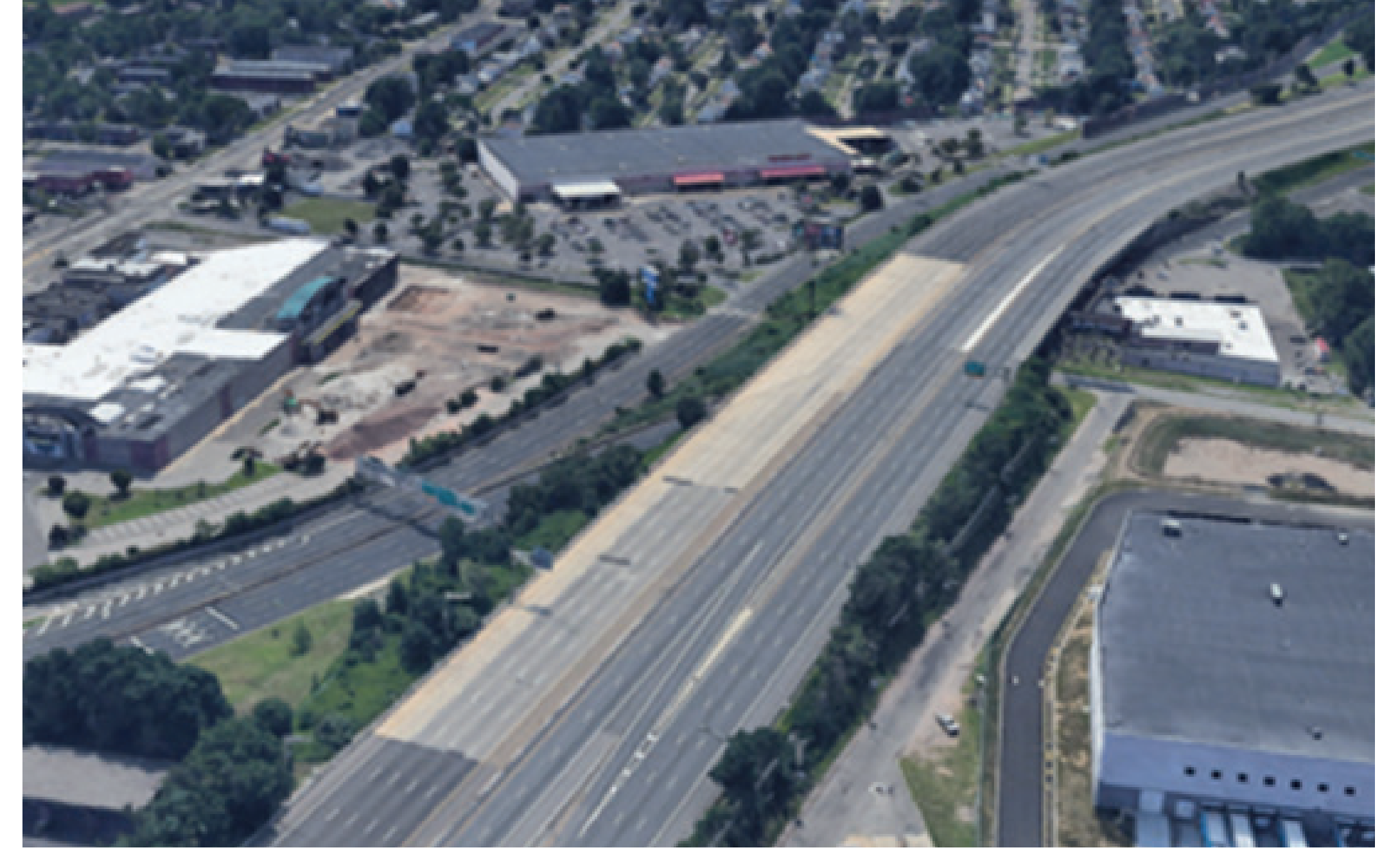
Borough of Totowa, Borough of Woodland Park and City of Paterson, Passaic County, New Jersey Borough of Elmwood Park, Township of Saddle Brook, Township of Rochelle Park, Borough of Lodi and City of Hackensack, Bergen County, New Jersey

The New Jersey Department of Transportation (NJDOT), committed to developing transportation improvements that best balance transportation needs, community interests, the environment, and costs, will hold a Virtual Public Information Center (PIC) to provide information about the Rt 80, Riverview Dr (CR 640) to Polifly Rd (CR 55) Project . You are encouraged to actively participate by providing comments by mail or email.